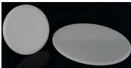
FWVC80 / 150

Concrete grey patches that are inserted into 20mm ferrules, when props have been removed from the panels. Eliminates grouting of the ferrule holes, even if the ferrules are not perpendicular to the panel face.