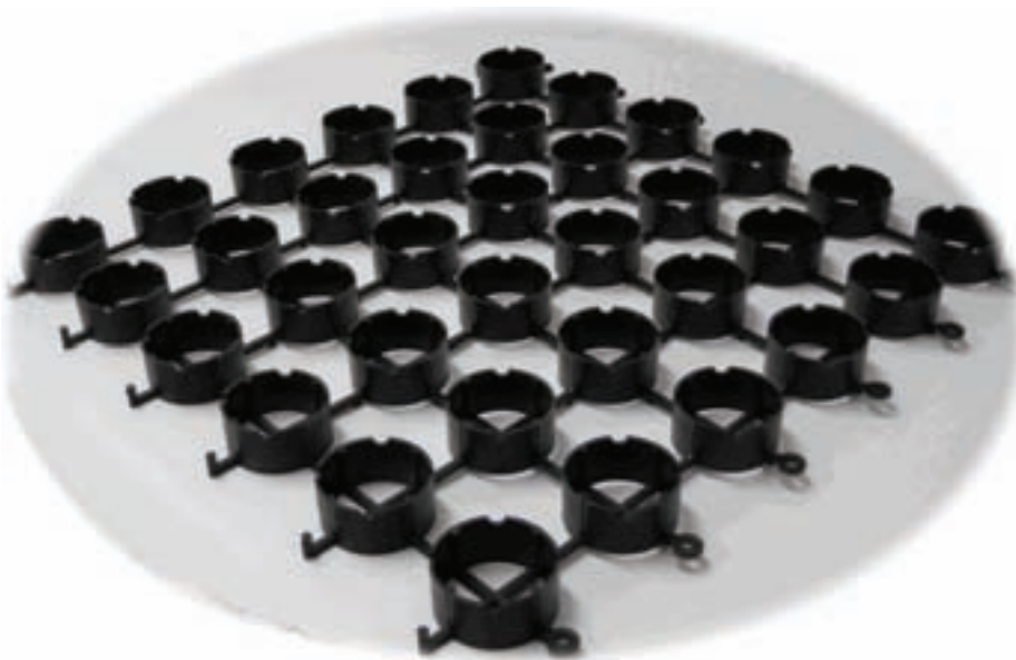
500mm x 500mm Ground Stabilising Module