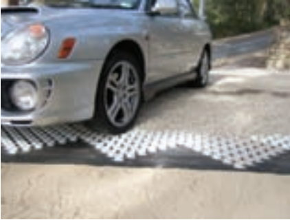
Stone Drive Ways