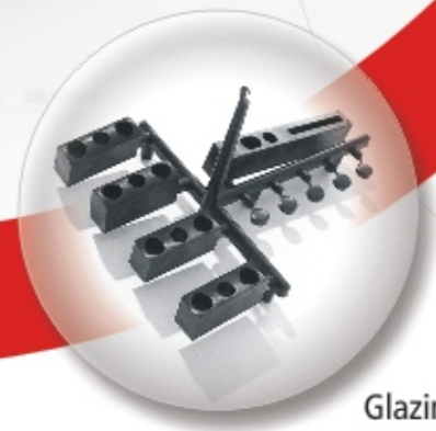
Glazing and Door Parts

Effective input from each of the team guarantees maximum environmental care.