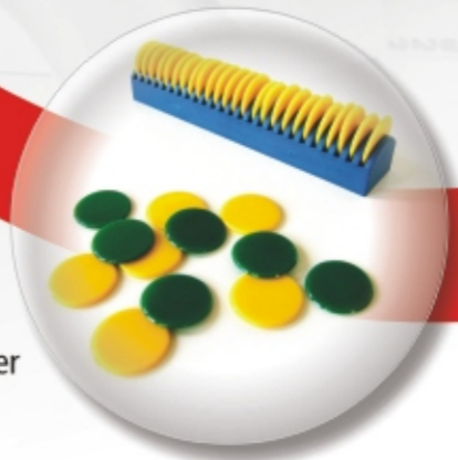
Tokens with Holder